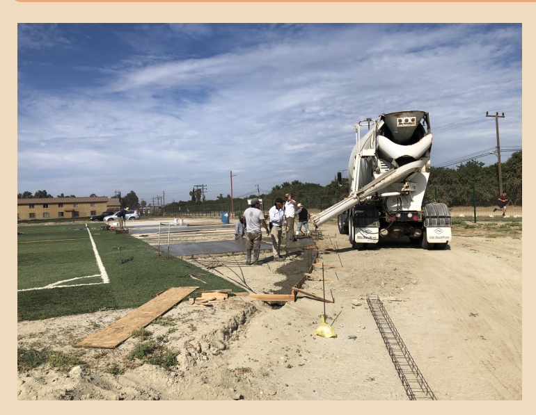
Cement being poured around the perimeter of the soccer field at FFHM in Mexico.

Thank you again to all of our school community for your generosity!